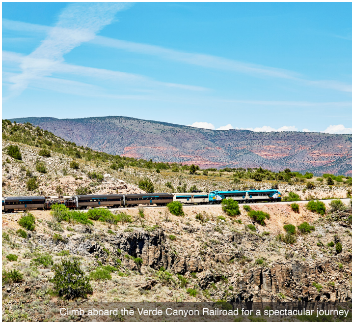
Climb aboard the Verde Canyon Railroad for a spectacular journey

DAY 5 Verde Canyon Railroad: This morning, stop in Jerome, an old mining town and melting pot for those who dreamed of making a quick fortune. Once virtually a ghost town, it is now restored with shops, museums and art. Later, climb aboard the Verde Canyon Railroad for a spectacular journey over old-fashioned trestles, past ancient Indian ruins and through a 700-foot tunnel. Enjoy the views from the comfort of your First Class seat or from one of the open-air viewing cars. Watch for wildflowers, blooming cacti and wildlife in their natural habitat. Tonight, chow down with a chuckwagon supper at the “Blazin’ M Ranch” and Western Stage Show. Meals: B, D