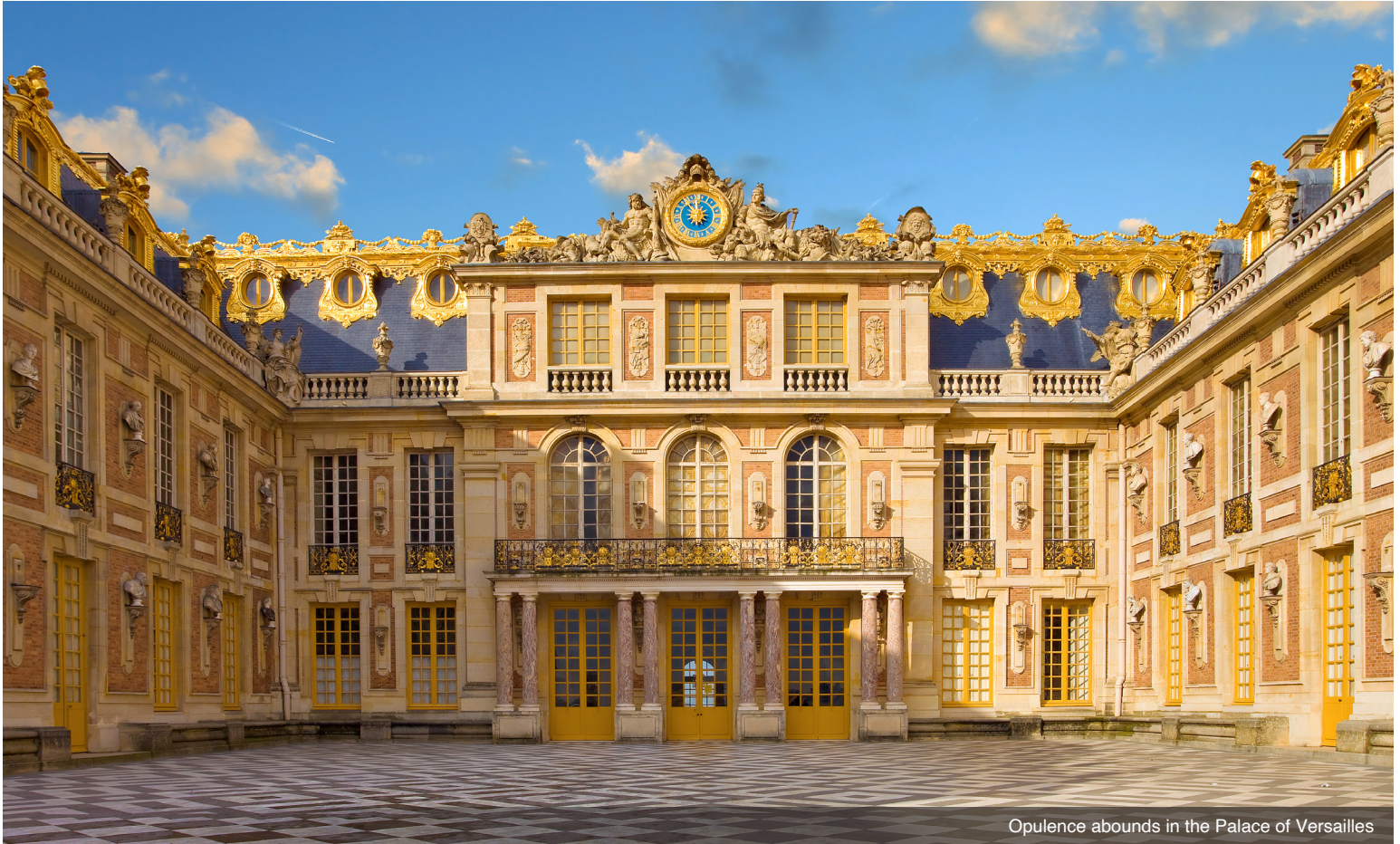
Opulence abounds in the Palace of Versailles