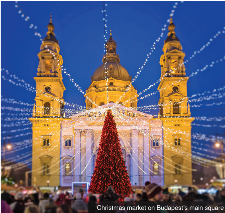
Christmas market on Budapest's main square