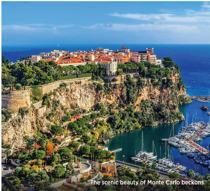
The scenic beauty of Monte Carlo beckons

d'Avignon, an ancient stone bridge crossing the Rhône. This evening you are invited to join the unique experience of a classical concert in Avignon. Meals: B, L, D