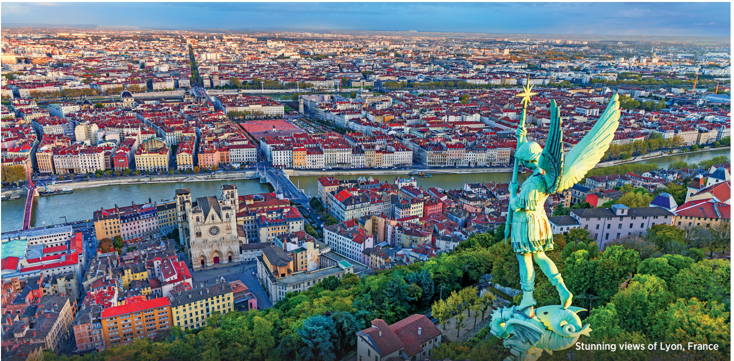
Stunning views of Lyon, France