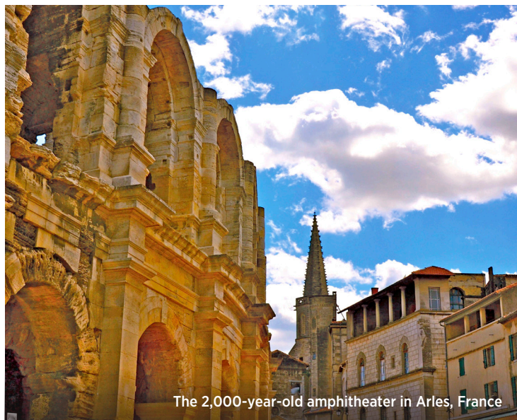
The 2,000-year-old amphitheater in Arles, France

France's third-largest city, Lyon, is a former Roman capital, steeped in history and considered to be the gastronomic heartbeat of the country. Home to traditional Lyonnaise cuisine, you'll enjoy an array of exemplary culinary delights. Today, a guided city tour awaits you, including a visit to the UNESCO World Heritage-listed Basilica Notre-Dame de Fourvière, part of the inscribed historic site of Lyon.