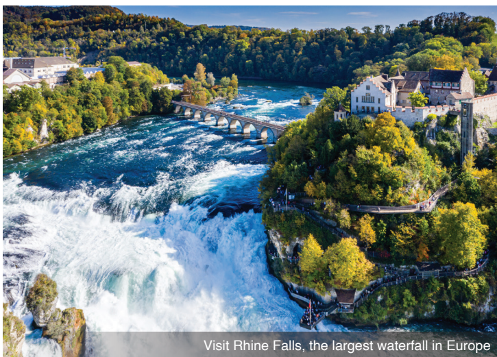
Visit Rhine Falls, the largest waterfall in Europe