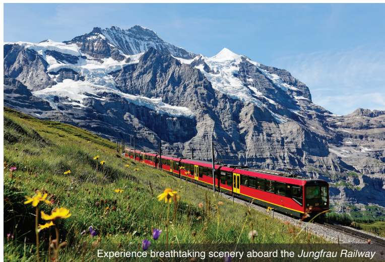
Experience breathtaking scenery aboard the Jungfrau Railway

DAY 1 Depart the USA: Depart the USA on your overnight flight to Zurich, Switzerland.