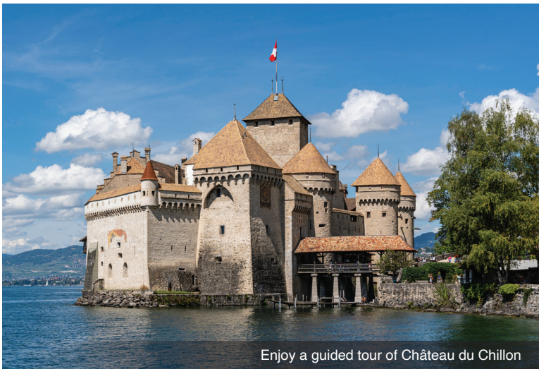
Enjoy a guided tour of Château du Chillon

During free time, walk along the Brunnengasse, a street that earned the title of “the most beautiful street in Europe”, and home to many 18th-century houses with wood-carved embellishments. Return by coach to the hotel with the remainder of the day at leisure. Meal: B