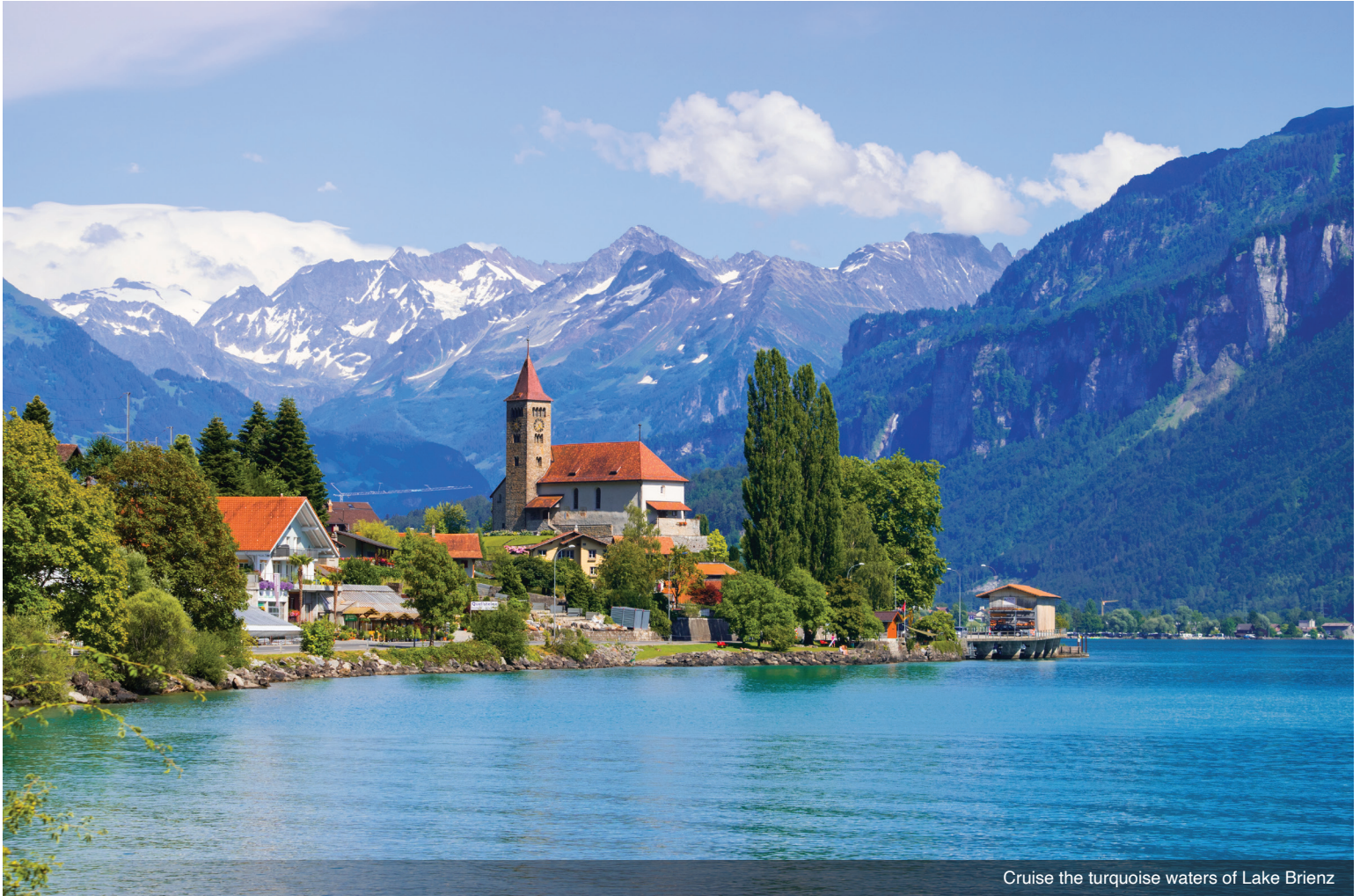
Cruise the turquoise waters of Lake Brienz