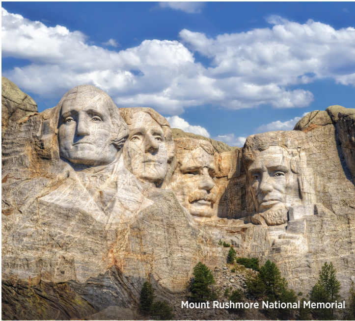
Mount Rushmore National Memorial

Enjoy time for shopping and an on own lunch. Then, a local guide takes you through Badlands National Park, a uniquely beautiful geologic area formed over millions of years by wind, rain and erosion. Return to Rapid City for a farewell dinner featuring the entertainment of an Indian dancer, storyteller and flute player. Meals: B, D