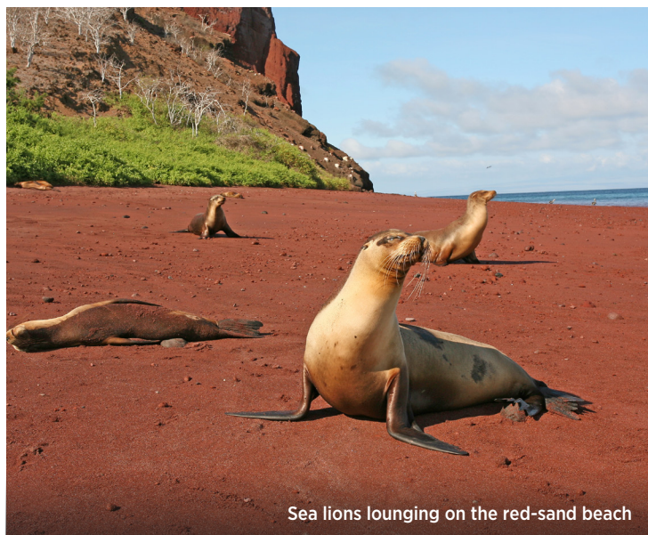
Sea lions lounging on the red-sand beach

After breakfast, enjoy a guided tour of Quito. The first city to be named a UNESCO World Heritage Site in 1978, Quito boasts a historic center and centuries-old landmarks, dating back 500 years. See Independence Square, flanked by Presidential and Archbishop's palaces. Visit 'Mitad del Mundo' and the Equator Monument, which stands at 0 degrees, and feel what it's like to be standing in the middle of the world. During the included city tour, see a bull fighting ring and the gilded Spanish colonial church. This evening, enjoy the city on your own. Meals: B, L