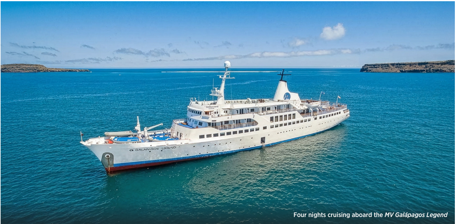
Four nights cruising aboard the MV Galápagos Legend