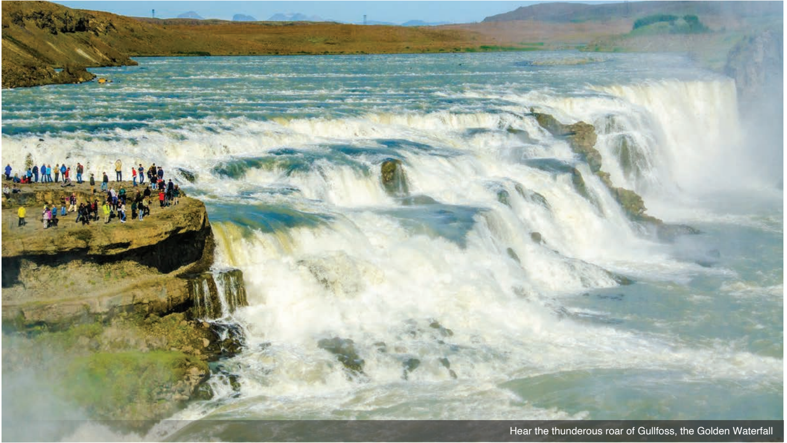
Hear the thunderous roar of Gullfoss, the Golden Waterfall