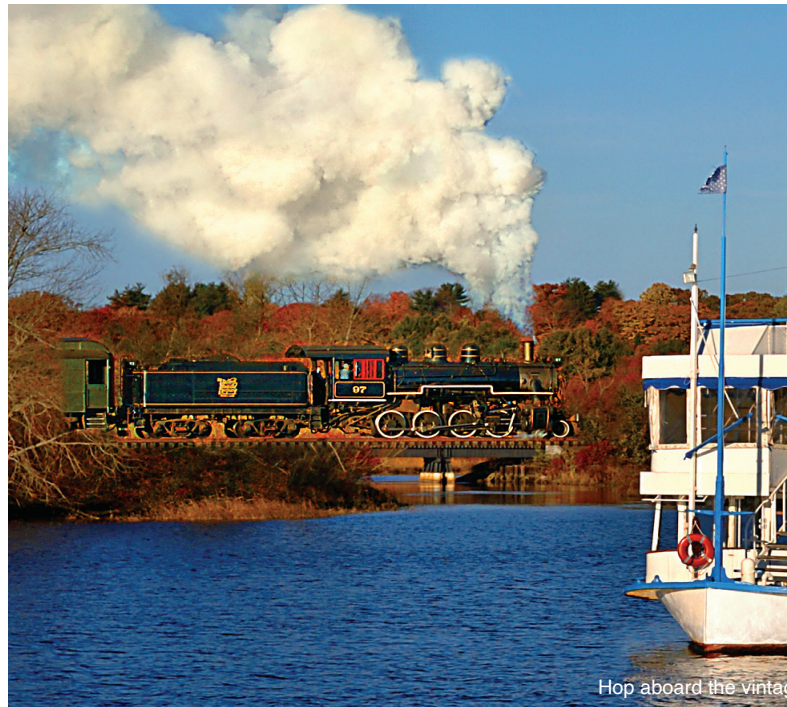
Hop aboard the vintage

DAY 1 Arrive in Boston: Arrive in Boston, Massachusetts with an included transfer to your hotel. Meet your Tour Manager in the hotel lobby at 6:00 p.m. for a welcome dinner. Meal: D