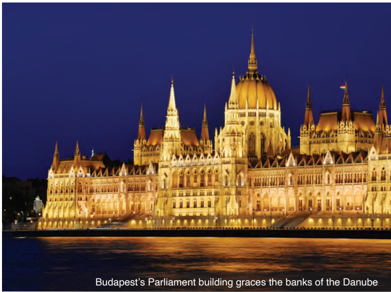
Budapest's Parliament building graces the banks of the Danube

DAY 9 Bratislava, Slovakia: Set on the crossroads of ancient trade routes in the heart of Europe, Bratislava, the capital of Slovakia, embodies various cultures – primarily Celtic, Roman and Slavic. Enjoy a guided walking tour through the lanes of the enchanting Old City with its Town Hall, Episcopal Summer Palace and the Slovak National Theater. Alternatively, embark on a guided hike to Bratislava Castle, offering beautiful views of the Danube. This afternoon, a highlight of the day will be a home-hosted visit where you are treated to tasty home-made specialties in the home of local Slovaks. What a unique opportunity to meet the locals and learn about life in Slovakia! This evening enjoy a gala dinner onboard. Meals: B, L, D