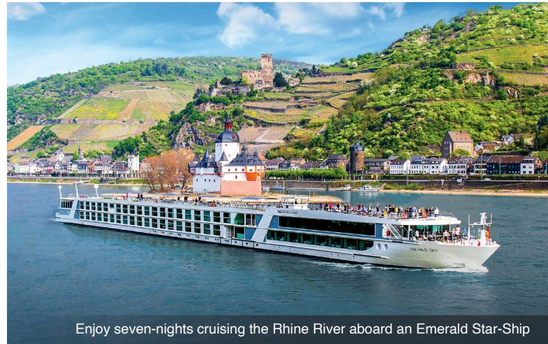
Enjoy seven-nights cruising the Rhine River aboard an Emerald Star-Ship

DAY 1 Depart the USA: Depart the USA on your overnight flight to Amsterdam, the Netherlands.