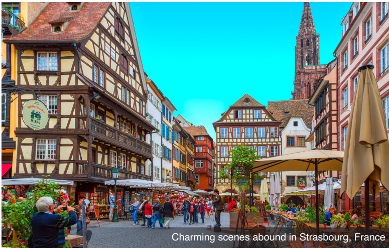
Charming scenes abound in Strasbourg, France

to the beautiful city of Lausanne. The remainder of the day is at leisure to begin exploring your new surroundings. Enjoy an included dinner this evening at the hotel. Meals: B, D