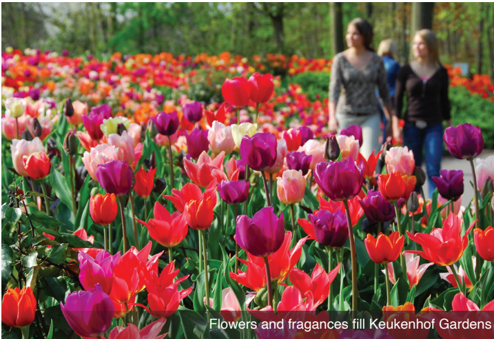
Flowers and fragrances fill Keukenhof Gardens