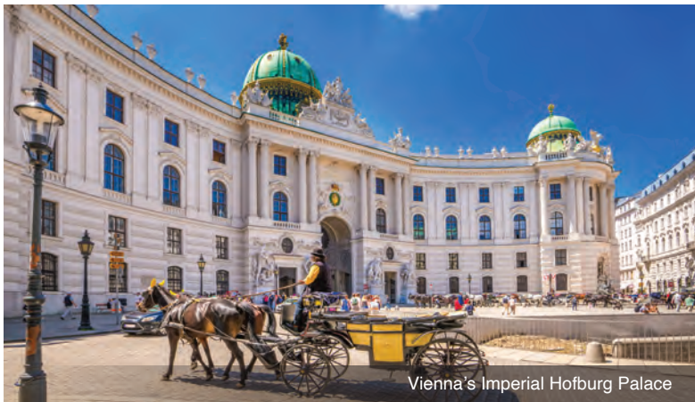
Vienna's Imperial Hofburg Palace

DAY 9 Bratislava, Slovakia: Today you sail into the capital of Slovakia. This graceful nation became an independent country in 1993, and since then, Bratislava has flourished as a new capital and made a name for itself as a cultural center. The romantic cobblestone lanes that weave through the city are explored with your local guide as you enjoy a walking tour of the ancient town center, seeing the Slovak National Theatre and a range of Gothic and Art Nouveau buildings. For the more active guests, embark on a guided hike to Bratislava Castle, a landmark steeped in legends that looks as though it came from the pages of a fairytale book. Meals: B, L, D EmeraldACTIVE: A guided hike to Bratislava Castle (instead of walking tour) DiscoverMORE: Carpathian Wine Route (additional expense) EmeraldPLUS: Local Slovakian entertainment onboard