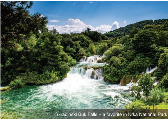
Skradinski Buk Falls – a favorite in Krka National Park