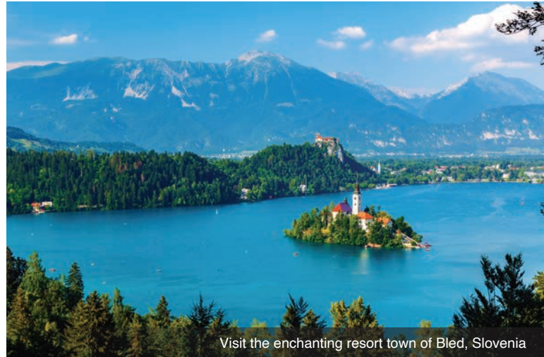
Visit the enchanting resort town of Bled, Slovenia

DAY 1 Depart the USA: Depart the USA on your overnight flight to Dubrovnik, Croatia.