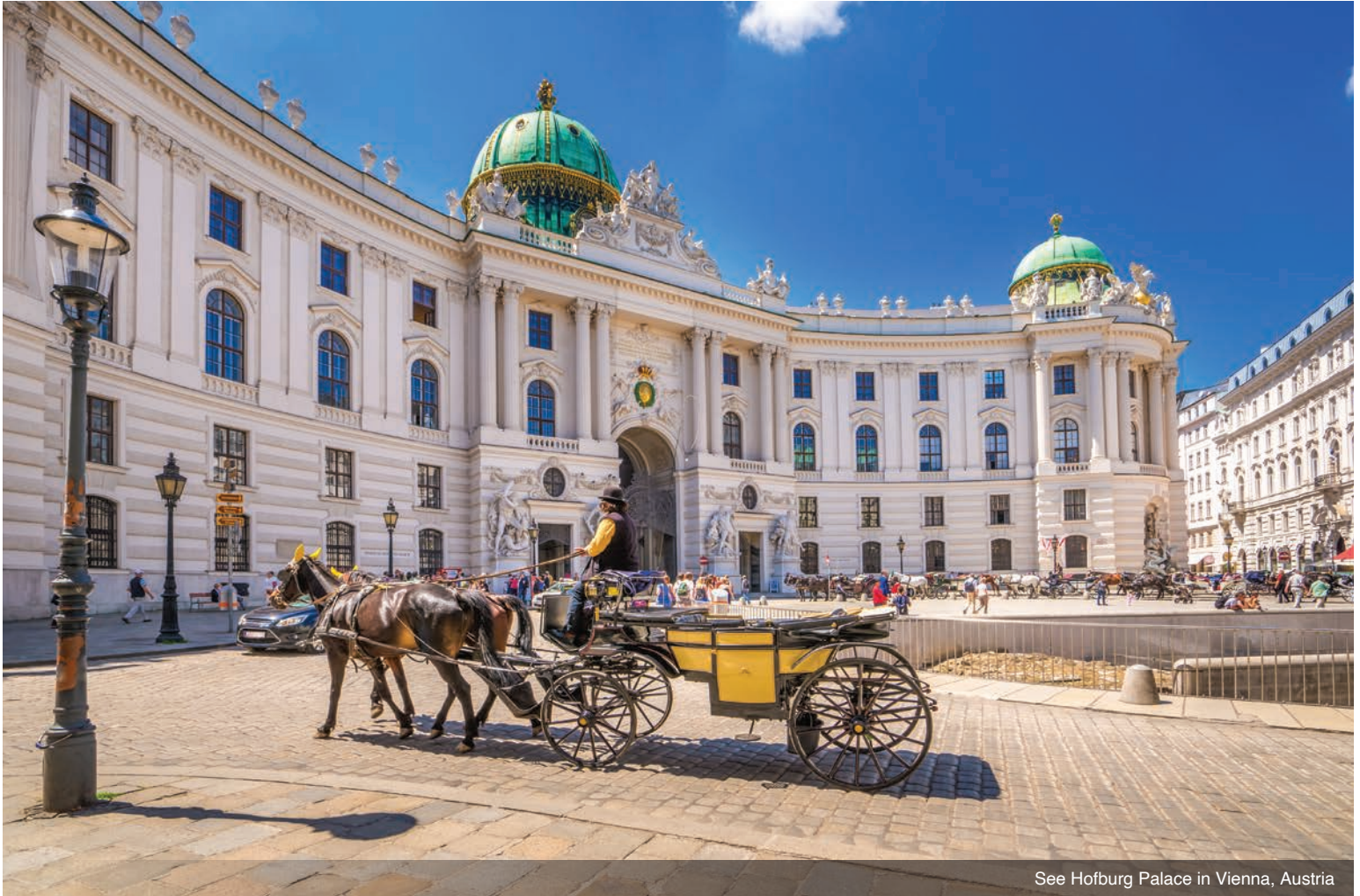
See Hofburg Palace in Vienna, Austria