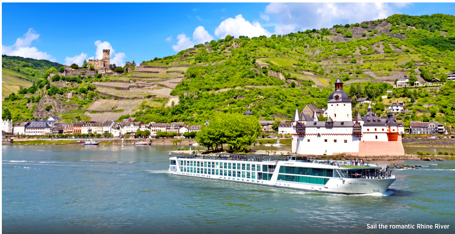
Sail the romantic Rhine River