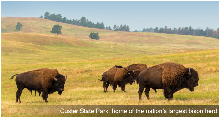
Custer State Park, home of the nation's largest bison herd

Rooms for the night before and after the tour are available. Cost for a room in Rapid City is $279, tax and breakfast included.