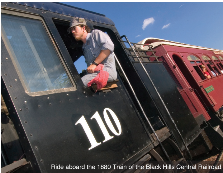
Ride aboard the 1880 Train of the Black Hills Central Railroad

DAY 5 Wall Drug Store and Badlands National Park: Begin the day at the Chapel in the Hills, a quiet retreat nestled at the foot of the Black Hills. Then stop at famed Wall Drug Store, a unique shopping emporium featuring western clothing, Indian pottery and favorite watering hole since the 1930s. Enjoy time for shopping and an on own lunch. Then, a local guide takes you through Badlands National Park, a uniquely beautiful geologic area formed over millions of years by wind, rain and erosion. Later, return to Rapid City for a farewell dinner featuring the entertainment of an Indian dancer, storyteller and flute player. Meals: B, D