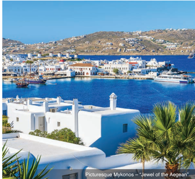
Picturesque Mykonos – “Jewel of the Aegean”

DAY 1 Depart the USA: Depart the USA on your overnight flight to Athens, Greece, a city with a history that dates back almost four millennia.