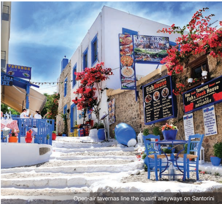
Open-air tavernas line the quaint alleyways on Santorini

with food. You'll sample the various products along with small crudites and create your own classification chart. The 'teacher' will then see how you did! After this experience, enjoy the remainder of the day at leisure. Browse in the boutiques, visit the beach or simply enjoy people-watching and meeting the locals at a sidewalk café. Meal: B