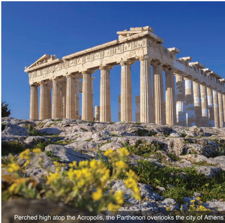
Perched high atop the Acropolis, the Parthenon overlooks the city of Athens