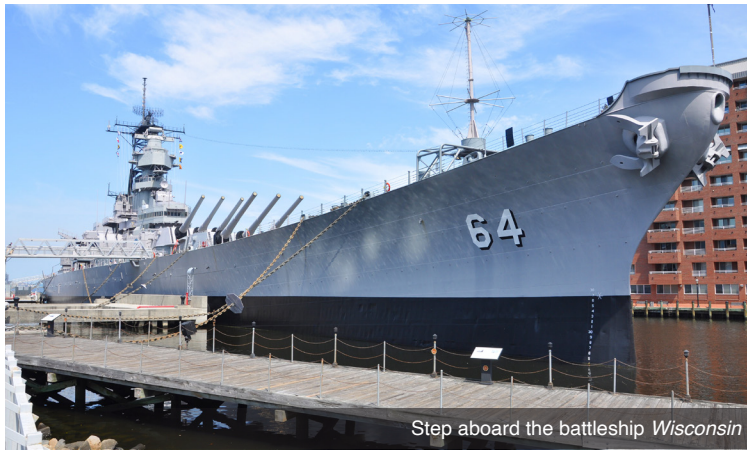
Step aboard the battleship Wisconsin

Then witness the incredible Sail250® Virginia's "Parade of Sail" from the comfort of your cruise vessel. Sit back, relax while taking in this milestone occasion as a fleet of the world's most magnificent international tall ships and military ships in an epic peacetime gathering. Norfolk is a selected gathering port for more than 55 ships from 20 nations. Numerous food trucks will be available for you to have lunch when you arrive at Fort Monroe. Explore the history and significance of Fort Monroe, a National Historic Landmark, whose history spans 400 years.