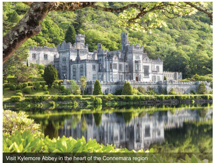
Visit Kylemore Abbey in the heart of the Connemara region

Filled with memories of the Emerald Isle, transfer to Dublin Airport for your flight home. (Breakfast)