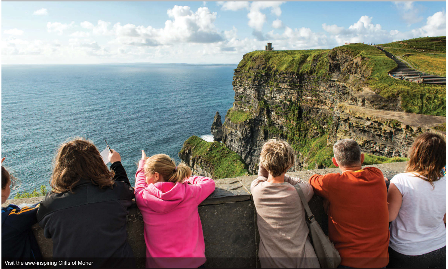
Visit the awe-inspiring Cliffs of Moher