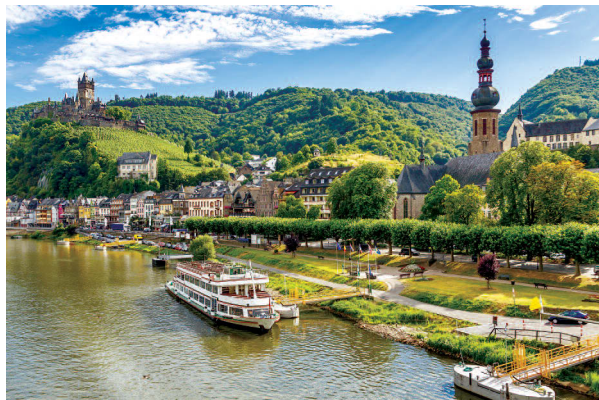
Reichsburg Castle stands guard over Cochem, Germany