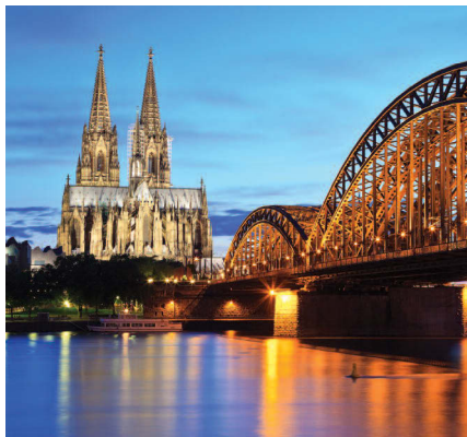
Cologne, Germany's imposing cathedral