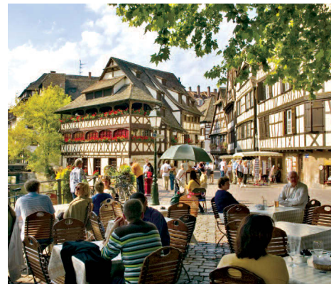
Meander through the quaint streets of Strasbourg, France

walls that provide contrast to the surrounding lush vegetation. With a late afternoon departure, the ship sails on to the charming town of Boppard. Following dinner, enjoy a special performance in the lounge by local German entertainers.