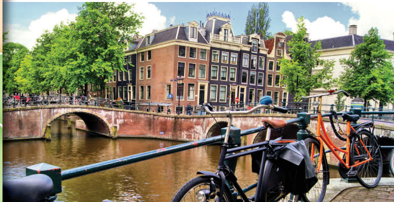
Lovely canals grace Amsterdam, the Netherlands